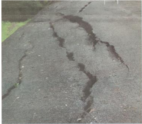
Below: "The Slump" and "the 1998 Slide" in March 2017.