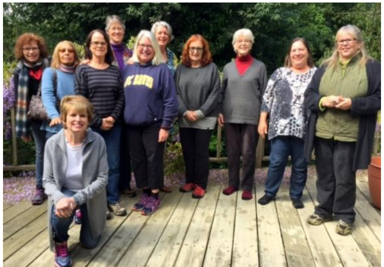
The COPE Cadre