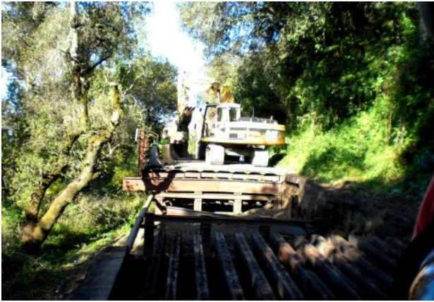
Left: Completion of the repair of the South Fitch Mountain Road viaduct in 2011.