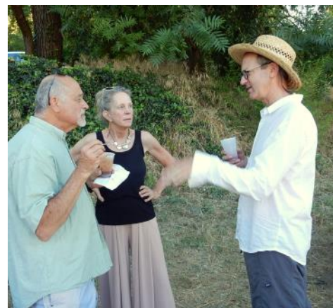
Some of those who “mixed” on June 17th